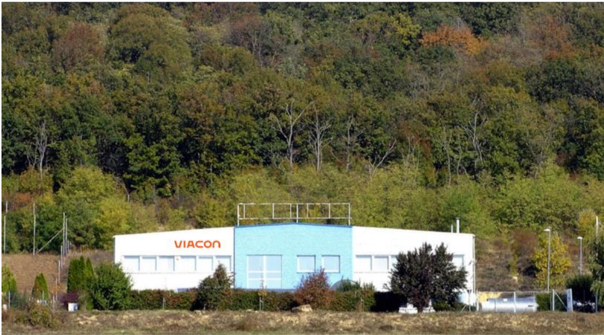
Figure 1 The view of ViaCon Hungary manufacturing plant located in Biatorbágy.

Serving both public and private sectors, ViaCon Hungary has completed numerous projects, from large-scale bridges to complex drainage systems. With the resources and expertise of the ViaCon Group, it is a trusted partner in creating modern, sustainable infrastructure.