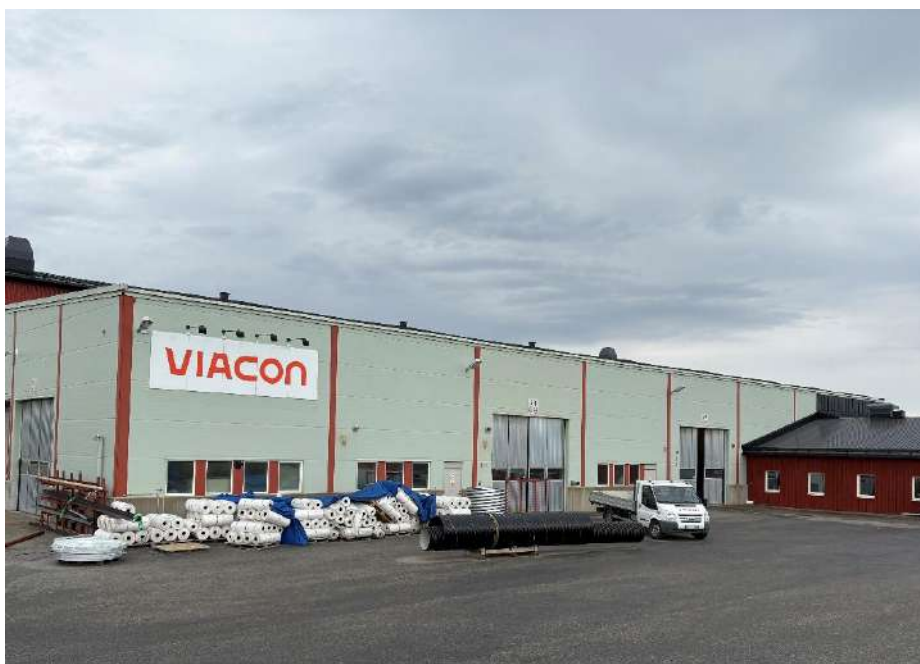
Figure 1 The view of ViaCon Sweden manufacturing plant located in Lycksele

The manufacturing plant is in Lycksele, Västerbotten, Sweden (Figure 1).