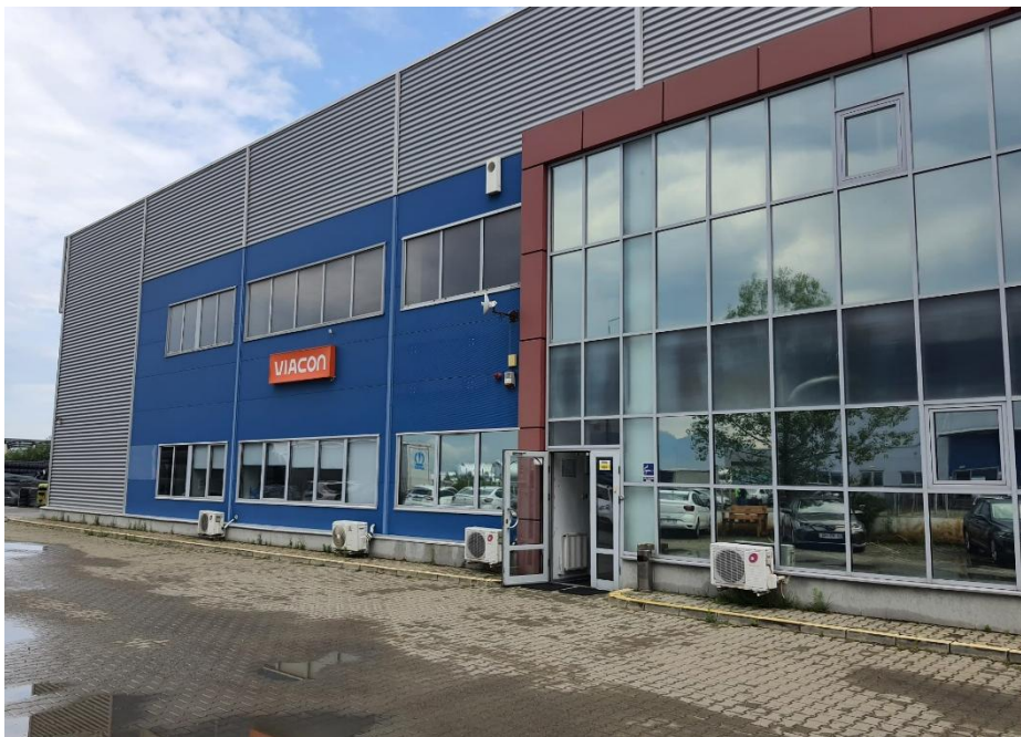
Figure 1 The view of ViaCon Romania manufacturing plant located in Prejmer

The manufacturing plant is in Prejmer, Romania (Figure 1).